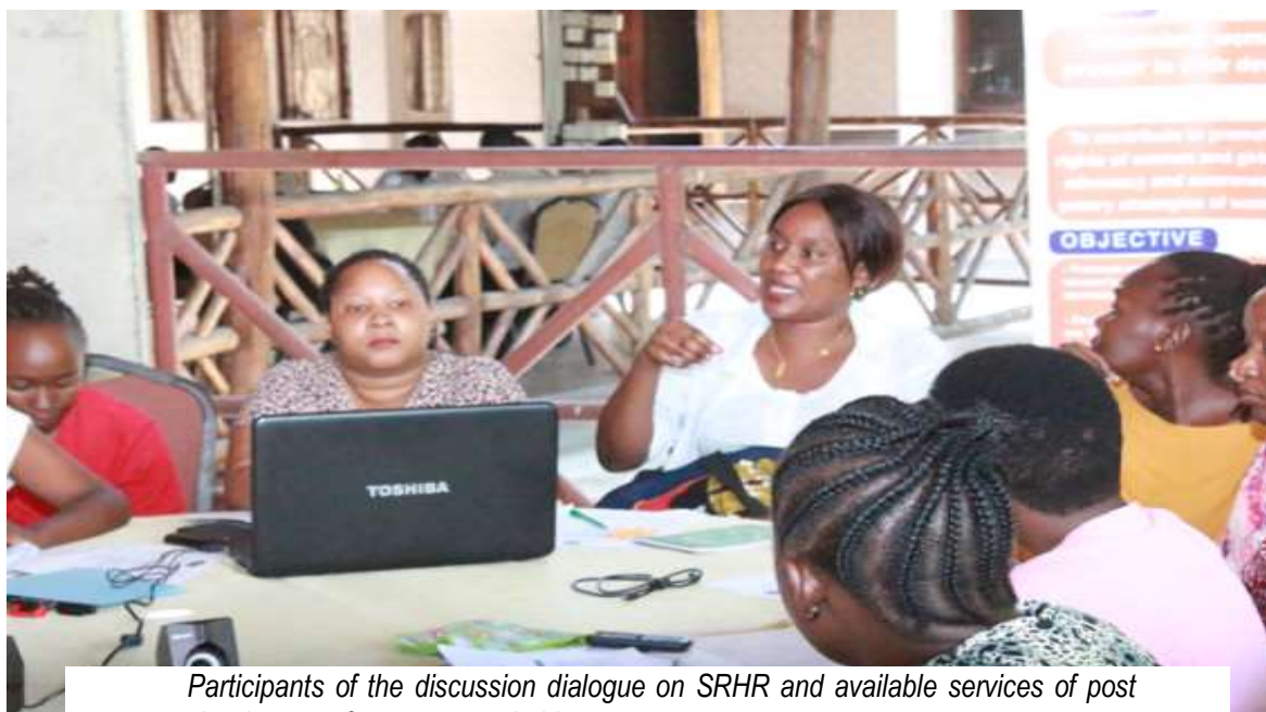
Participants of the discussion dialogue on SRHR and available services of post abortion care for women and girls

This activity was done in collaboration with the coalition member Young and Alive Initiative (YAI). The Dialogue aimed at increasing understanding and awareness to WHRDs of Tanzania on sexual reproductive health and rights (SRHR) by discussing how unsafe abortion and lack of post-abortion care services affect the reproductive health of women and girls as well as recommend the strategies to solve the problem.