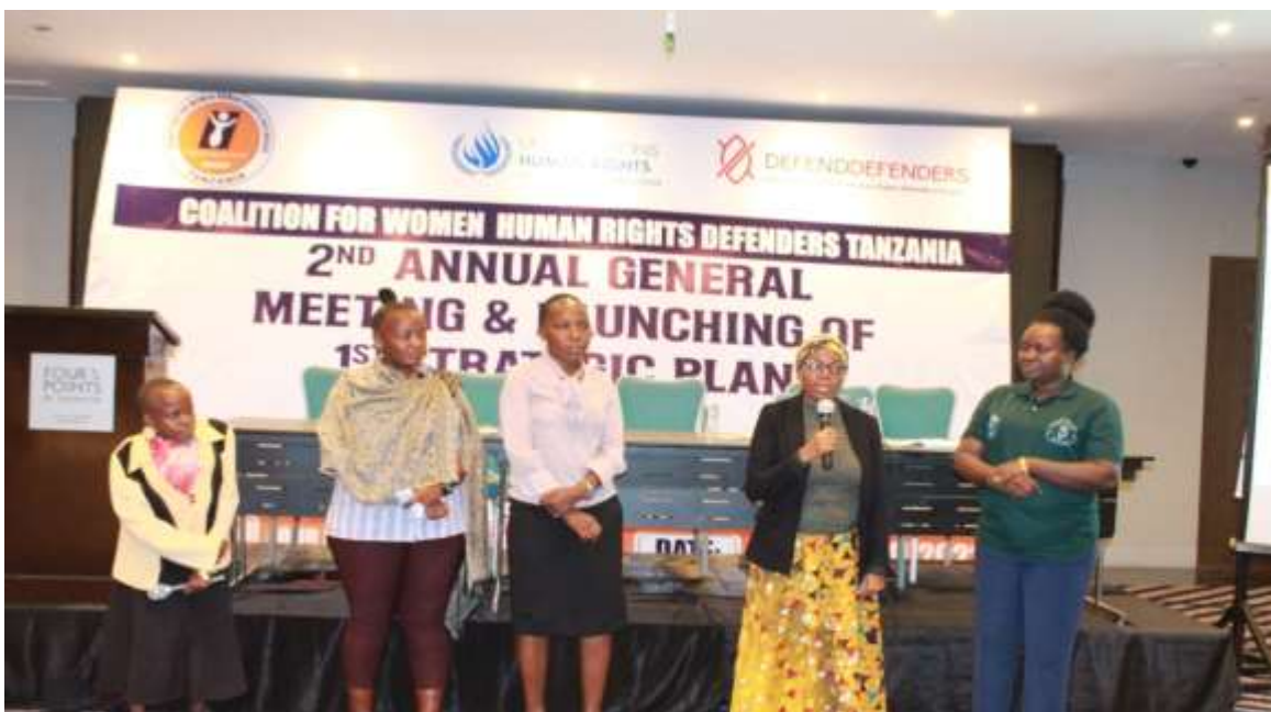
Candidates vying for Board membership ask for votes from Annual General Meeting members