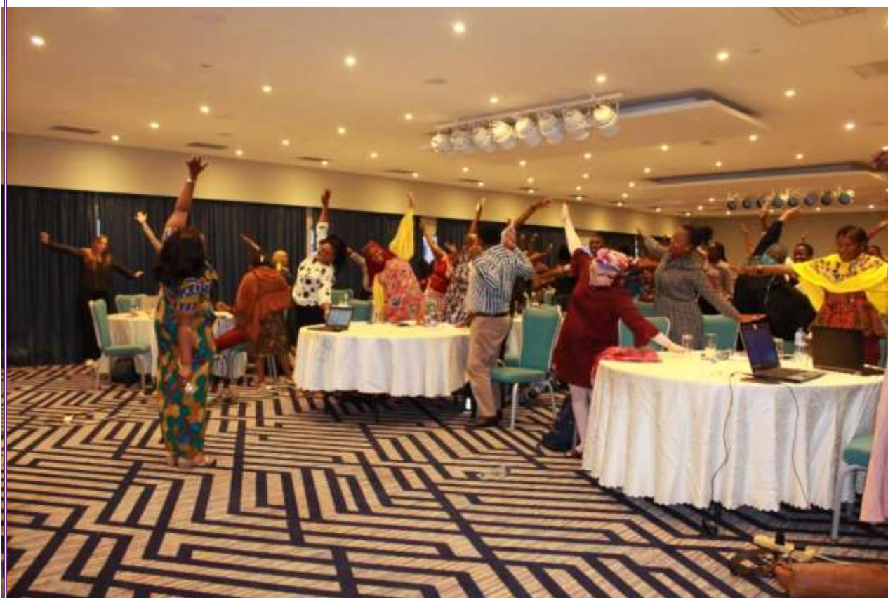
The learning by doing approach was practiced during WHRDs self-care and well-being session

Coalition conducted self-care and well-being session to WHRDs on 20 th April 2022, to reduce incidences of mental health to WHRDs. UN OHCHR-EARO facilitated the technical support to WHRDs in how to remove work stresses and traumas resulting from defending works.