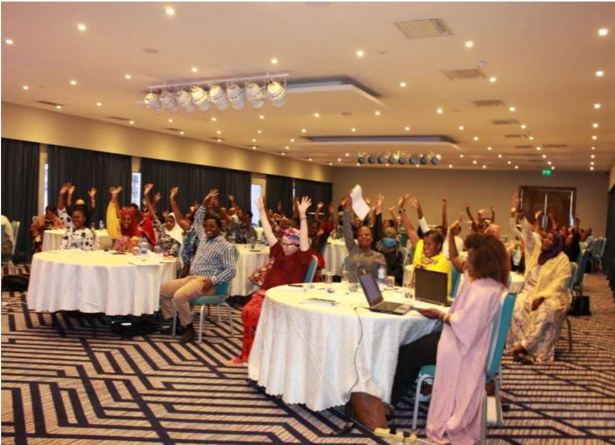
Group photo of participants during the CWHRDs Annual General Meeting

New Board of Directors (4members) were elected and 2 members were re-elected to support secretariat on the implementation of its five-year Strategic Plan for 2022- 2026.