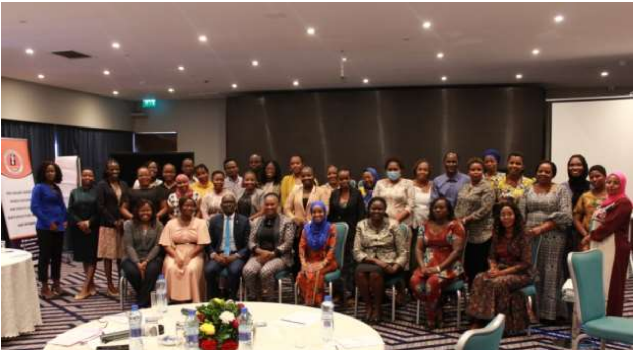
Group photo of WHRDs, facilitators and commissioner from CHRAGG attended the training on monitoring, documentation and reporting on Economic, Social Cultural Rights.

The participants were also informed to understand that National Human right Action plan should recognize the protection and promotion of human rights and not limited to a single topic, sector, or government ministries, departments or agency and it should identify twenty-three human rights issues including economic, social and cultural rights that address the right to the highest attainable standard of physical and mental health.