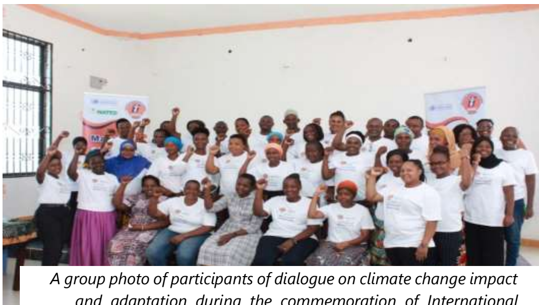
A group photo of participants of dialogue on climate change impact and adaptation during the commemoration of International

During the dialogue, participants got a chance to watch documentary video recorded from Mazingara Ward, Handeni District explaining on the impacts of climate change to women and girls. The impacts including: - increased risk of violence against women and girls and increased risk of child marriage the situation pushing women to become more economically dependent on men. It was also revealed that girls are more likely to miss classes or drop out of school due to lack of water for sanitation and increased engagement in the domestic roles mainly of fetching water and collecting firewood. Climate change also increased risk of maternal mortality rate.