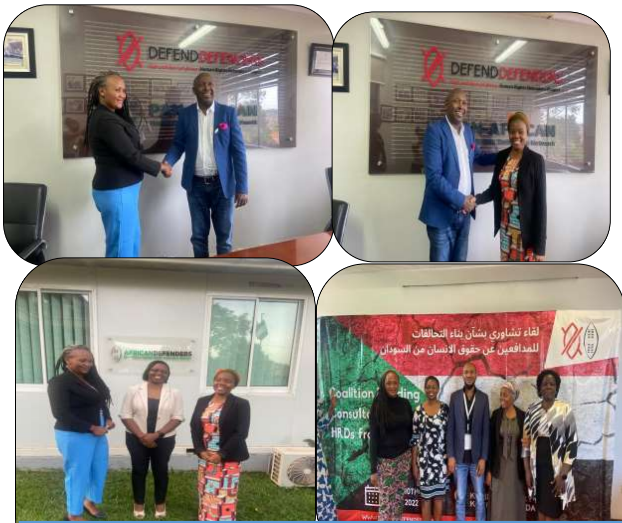
The chairperson and National Coordinator of the Coalition visited Regional Human Rights Defenders Coalition (RHRDC) to learn and strengthen their partnership towards protection of WHRDs. In the pictures are National Coordinator with RHRDCs Executive Director, Program Director and Administration Manager.

In both events, Board and secretariat learned lessons on monitoring and evaluation, digital security for HRDs and advocacy.