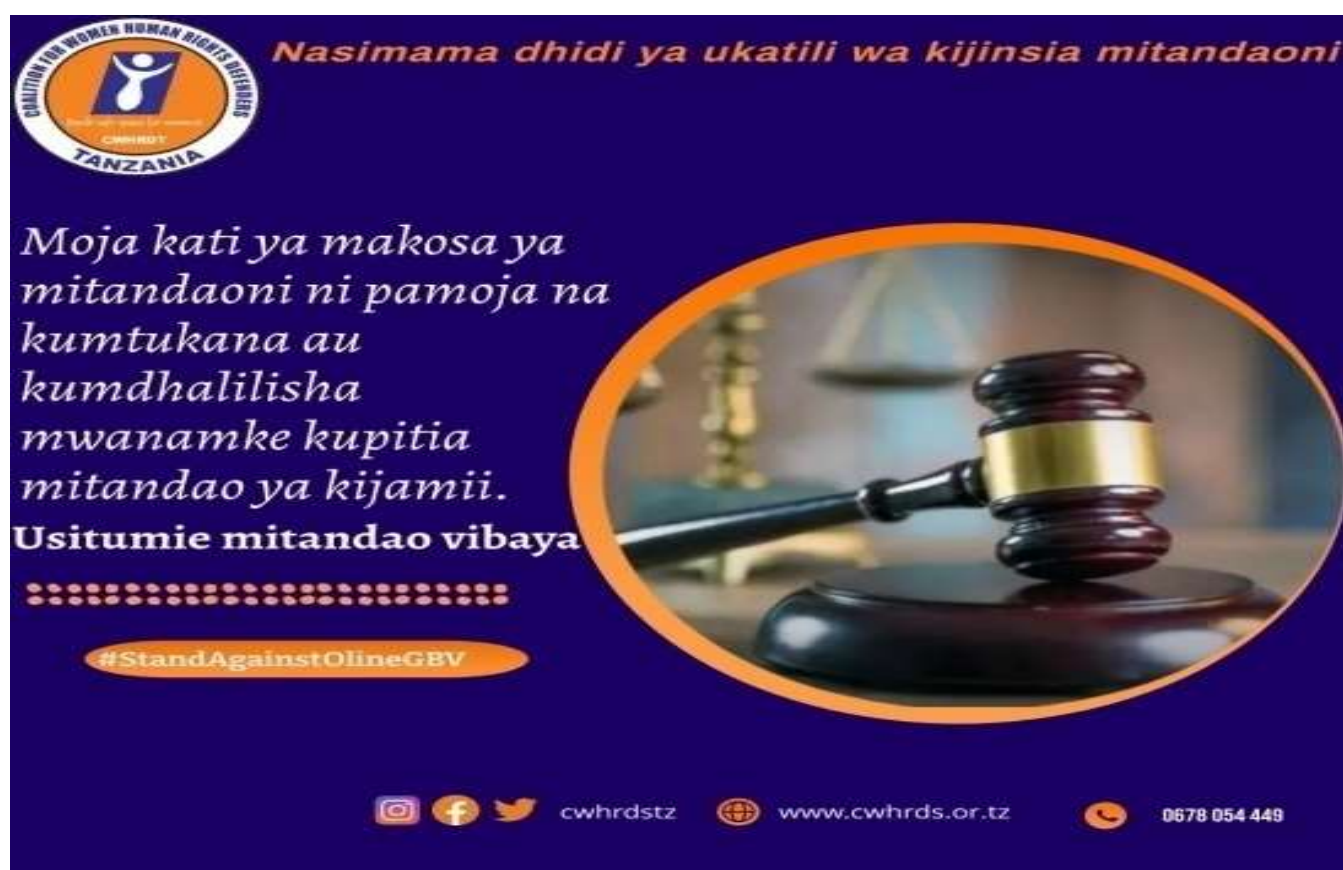
One of the posters carrying different messages against online gender-based violence

On March 22, 2022 Coalition launched the second campaign against online GBV themed “ Nasimama Dhidi ya Ukatili wa Kijinsia Mitandaoni ” ( I stand against online GBV ). During the campaign, social media posters with different messages were posted based on equal rights to use social media, legal implications of online GBV et,c aimed at protecting the rights of women and girls including WHRDs and women in leadership against online gender-based violence.